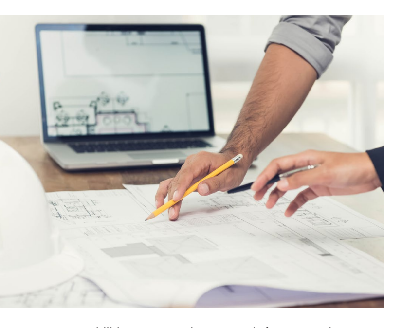
"Cross-checks between building model inputs and design/ construction parameters are often overlooked."

capabilities, nomenclature, and format and content for simulation input and output reports. Submittal reviewers often do not have the relevant experience with the tools used on projects that they are reviewing and struggle with identifying inputs and outputs of interest. The simulation reports generated by the tools can span hundreds of pages. Cross-checks between building model inputs and design/construction parameters are often overlooked, resulting in discrepancies between the building design/construction and the modelled systems and components, which may have a significant impact on performance. Program administrators have different levels of technical sophistication and different budgets for enforcing the requirements and may not be able to identify discrepancies in simulation outcomes. Some program administrators have staff specializing in model reviews, but most do not.