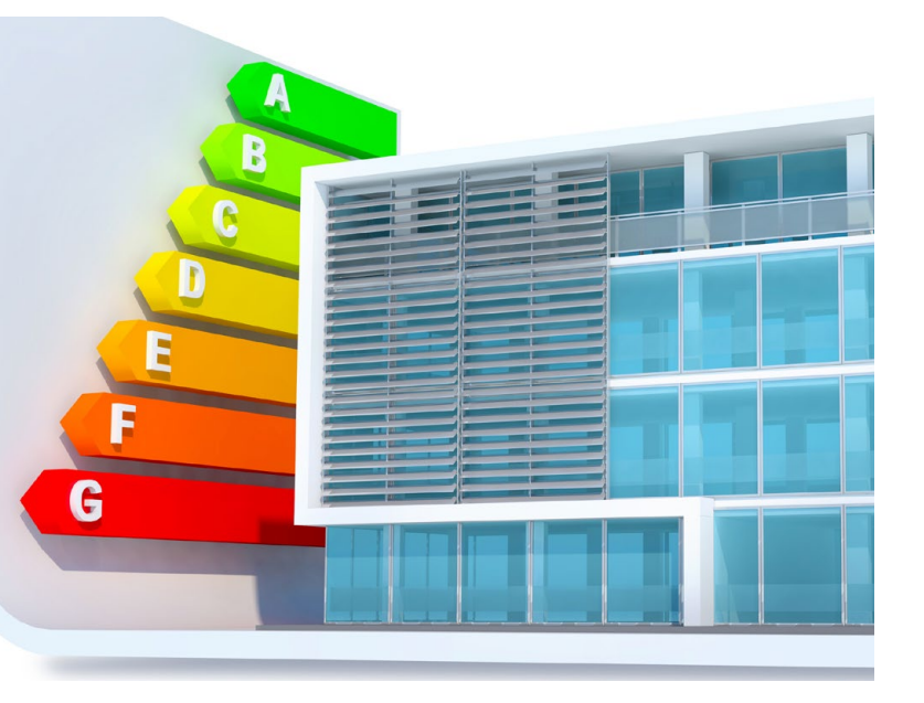
"Building energy modelling is used... to document compliance with energy codes, optimize the design of new buildings, and inform project retrofits."

QUALITY ASSURANCE AND QUALITY CONTROL OF BUILDING ENERGY MODELLING FOR PROGRAM ADMINISTRATORS